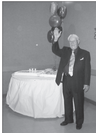
Orville at his 100 th birthday party

Orville's message: don't put off improving your quality of life, regardless of your age, or stage, in it.